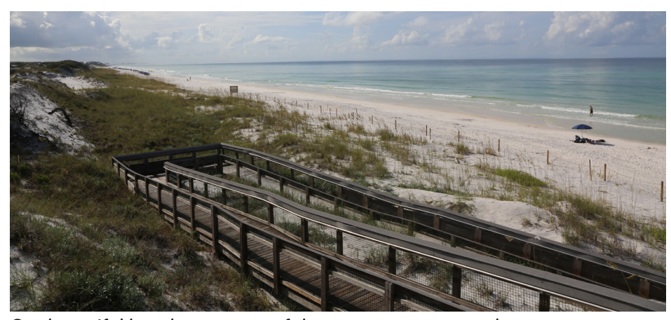
Our beautiful beaches are one of the many reasons people move to our area.

"We like to perform upgrades 'just in time', which requires a combination of engineering analysis, long range planning and constant