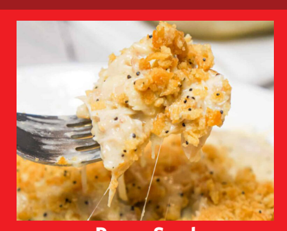
Poppy Seed Chicken Casserole

Visit CHELCO.com/recipes to learn this recipe!